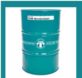
54-gallon drum SKU: MS692XT-54G UPC-12: 641238080114