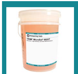
5-gallon pail SKU: MS692XT-5G UPC-12: 641238080121