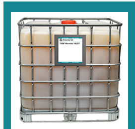
270-gallon tote SKU: MS692XT-270G UPC-12: 641238080145