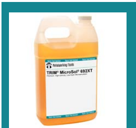
1-gallon jug SKU: MS692XT-1G UPC-12: 641238080138