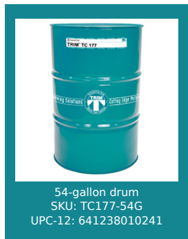
54-gallon drum SKU: TC177-54G UPC-12: 641238010241