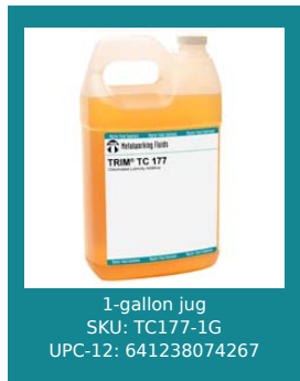
1-gallon jug SKU: TC177-1G UPC-12: 641238074267