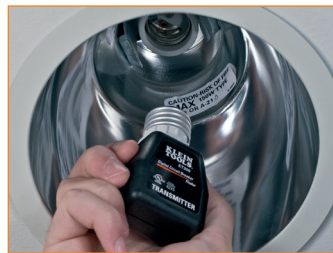
Light Socket Adapter

⚠WARNING: Read, understand, and follow all instructions, cautions and warnings attached to and/or packed with all test and measurement devices before each use.