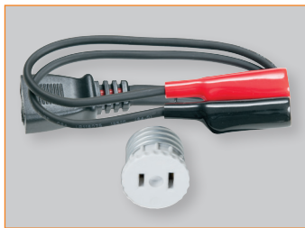
Kit (Adapter and Clips)