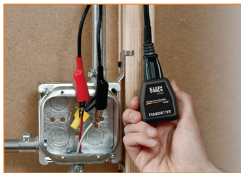
Alligator Clip Adapter for Bare Wires