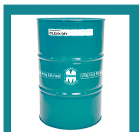
54-gallon drum SKU: CLDF1-54G UPC-12: 641238002710