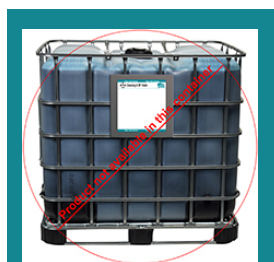
270-gallon tote SKU: CLEANDF1-270G UPC-12: