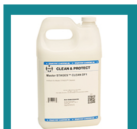
1-gallon jug SKU: CLDF1-1G UPC-12: 641238002680