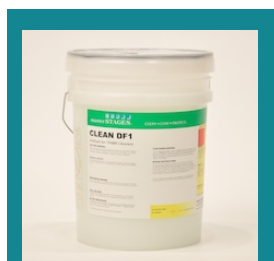
5-gallon pail SKU: CLDF1-5G UPC-12: 641238002703