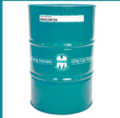
54-gallon drum SKU: NOCORE6-54G UPC-12: 641238042358