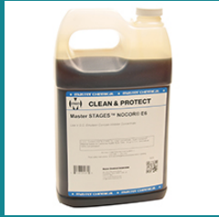
1-gallon jug SKU: NOCORE6-1G UPC-12: 641238042310