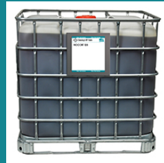
270-gallon tote SKU: NOCORE6-270G UPC-12: 641238042389