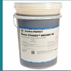
5-gallon pail SKU: NOCORE6-5G UPC-12: 641238042334