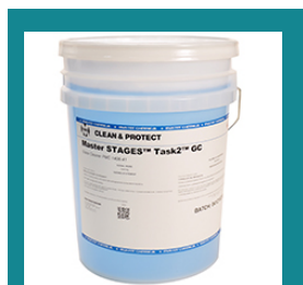
5-gallon pail SKU: TASK2GC-5G UPC-12: 641238000693