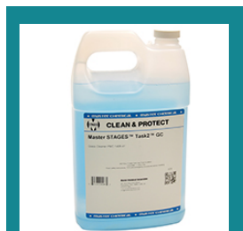
1-gallon jug SKU: TASK2GC-1G UPC-12: 641238000662