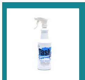
1-quart bottle SKU: TASK2GC-QT UPC-12: 641238047421