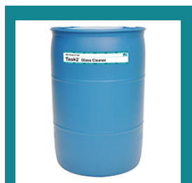
54-gallon drum SKU: TASK2GC-54G UPC-12: 641238047391