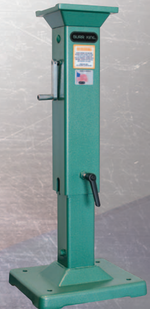
An adjustable height pedestal is the best way to prevent an unfriendly ergonomic work environment. Our adjustable height pedestal adjusts from 27"-37" inches.