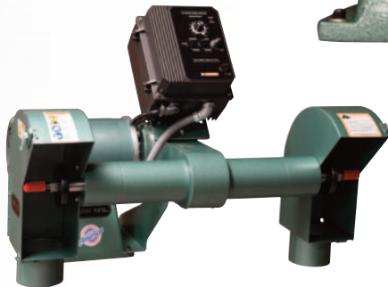
The 1001 can run up to 12" diameter wheels up to 2" wide. Dust scoops can be added as an optional accessory.

BUILT FOR THE MOST DEMANDING APPLICATIONS FOR DECADES OF SERVICE