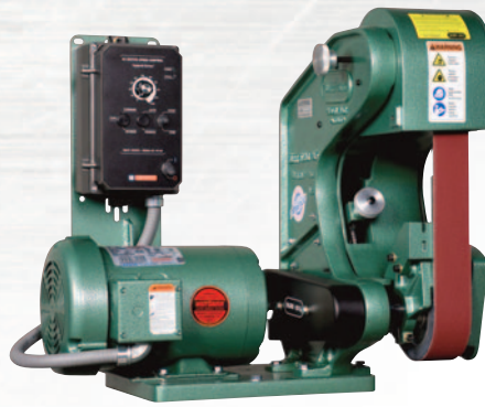
Optional variable speed provides speeds from 600-6000 SFPM