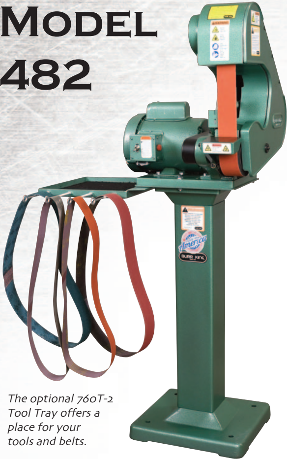
The optional 760T-2 Tool Tray offers a place for your tools and belts.