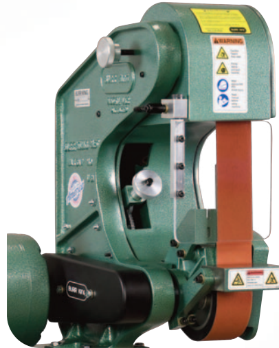
The optional 442SS Scatter Shield mounts directly to the guard and allows for a non-contact area in the slack of the belt. Easily adjust the shield with the toolless design.