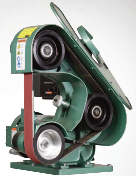
Urethane idler wheels are long lasting and electronically conductive