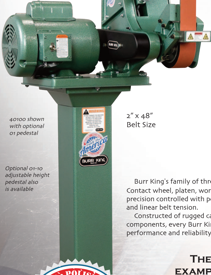
40100 shown with optional 01 pedestal