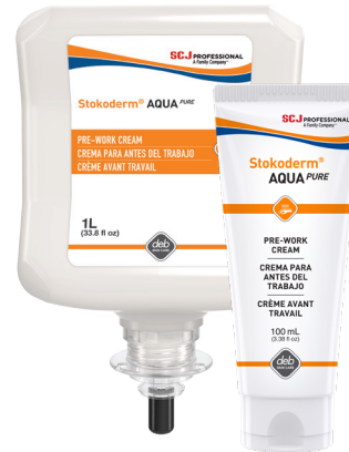
Application - Water-based substances

NB: Skin exposure to potentially harmful substances and environments should be avoided through the implementation of safe working practices and the use of appropriate Personal Protective Equipment. Where skin exposure cannot be avoided, it is recommended to use an appropriate skin defense cream as part of a complete skin care program to help promote healthy skin condition.