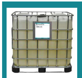
270-gallon tote SKU: C118-270G UPC-12: 641238081746