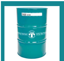
54-gallon drum SKU: C118-54G UPC-12: 641238081739