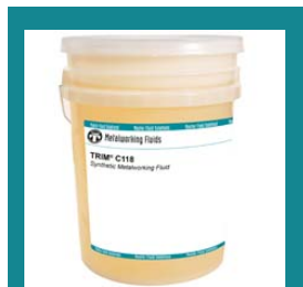
5-gallon pail SKU: C118-5G UPC-12: 641238081722