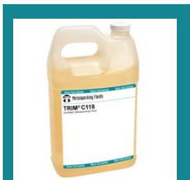
1-gallon jug SKU: C118-1G UPC-12: 641238081708