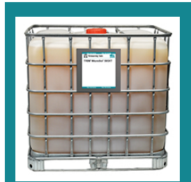
270-gallon tote SKU: MS585XT-270G UPC-12: 641238065852