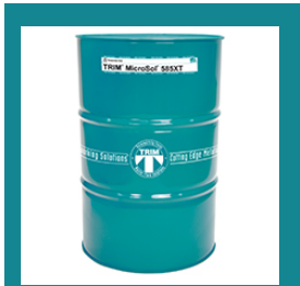
54-gallon drum SKU: MS585XT-54G UPC-12: 641238065814