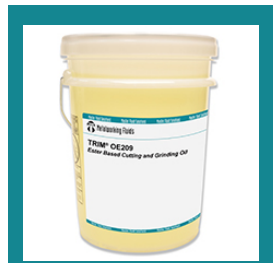
5-gallon pail SKU: OE209-5G UPC-12: 641238077374