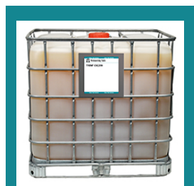
270-gallon tote SKU: OE209-270G UPC-12: 641238077404