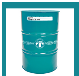
54-gallon drum SKU: OE209-54G UPC-12: 641238076650