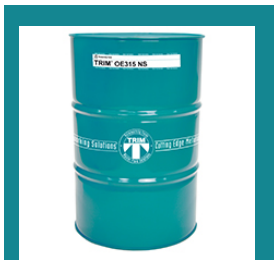
54-gallon drum SKU: OE315NS-54G UPC-12: 641238076667